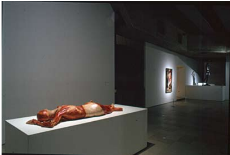
Installation shot Spectacular Bodies , Hayward Gallery, 2000-1: