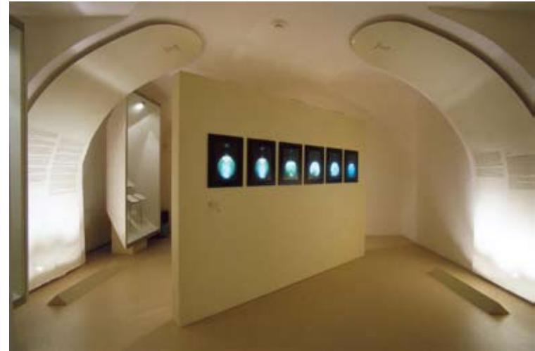
Installation shot Gregor Mendel: The Genius of Genetics , Brno, 2002-3

Advanced Centre for Biochemical Engineering, UCL Altepinakothek, Munich Ashmolean Museum, Oxford Barbican Art Gallery BIOS Centre, London School of Economics Center for Research and Restoration of Museums, Paris Christ Church Picture Gallery, Oxford Department of the History of Art, Oxford University The European Dana Alliance for the Brain The Field Museum, Chicago The Friends of the Mendel Museum, UK Hangar Bicocca, Milan The Hayward, London The Hunterian Museum, Royal College of Surgeons, London Institute and Museum of the History of Science, Florence Magdalen College, Oxford The Mendel Museum, Brno (Czech Republic) Museum of the History of Science, Oxford Opificio delle Pietre Dure, Florence The Royal Institution of Great Britain The Science Museum, London Stanton Williams Architects Surrey Ion Beam Centre, University of Surrey The Victoria and Albert Museum, London The Wellcome Trust Uffizi Gallery, Florence University of Oxford Botanic Gardens, Oxford VFG (Vereinigung zur Förderung der Genomforschung), Vienna