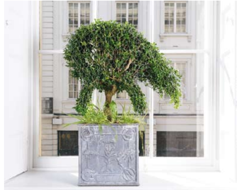
Installation shot Crossing Over , The Royal Institution of Great Britain, 2008

Crossing Over: Exchanges in Art & Biotechnologies The Royal Institution of Great Britain, 2008 Seduced: Art & Sex from Antiquity to Now Barbican 2007–8 Leonardo da Vinci Experience, Experiment & Design Victoria & Albert Museum 2006–7 Gregor Mendel: the Genius of Genetics Brno, 2002–3 Head on: Art with the Brain in Mind Wellcome Trust/Science Museum 2002 Spectacular Bodies Hayward Gallery 2000–1